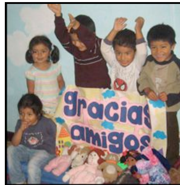
Thank you friends!

For more information visit our website www.mayachildcare.org